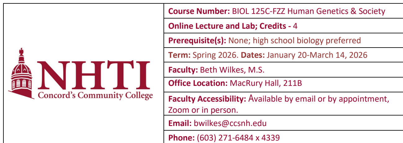
Table 1 Course Details