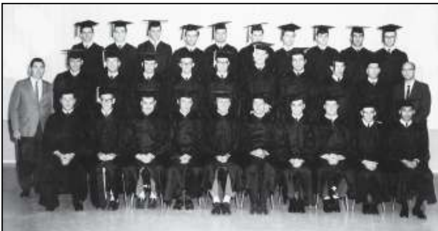
The Class of '66, NHTI's first graduates.

NHTI 50th Anniversary Commemorative Book is $50.