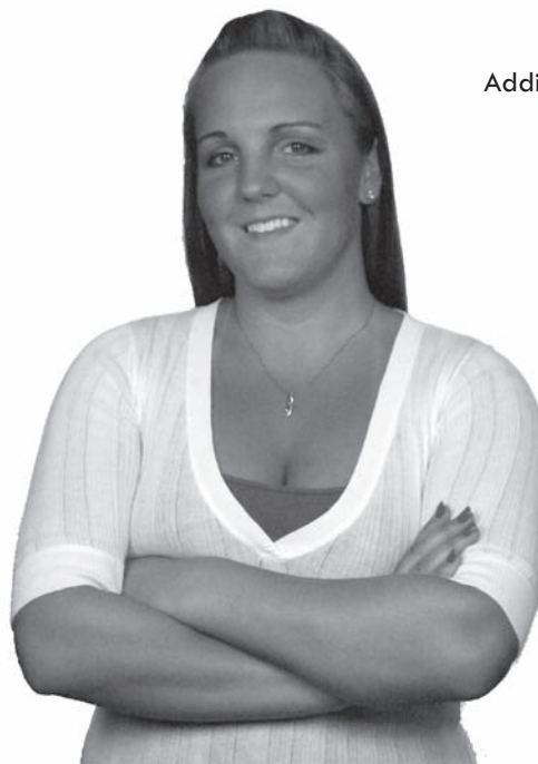
Harmony Addiction Counseling, Class of '12

"There's always something happening on campus!"