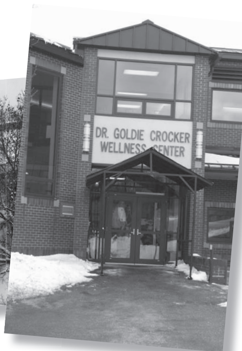
Dr. Goldie Crocker Wellness Center