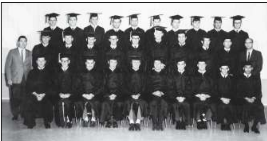
The Class of '66, NHTI's first graduates.