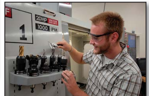
NHTI student working on the CNC machine.

NHTI has launched a new certificate program in Advanced Manufacturing Processes as a way to help employers fill the gap of skilled workers. The certificate is designed to provide the basic knowledge of machining operations using traditional machine tools and basic CNC programming and CNC machine operation.