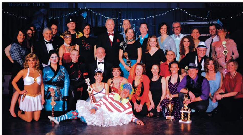
The dancers and instructors celebrate together at the end of 'Dancing with the Concord Stars' event.

But the highlight of the evening was when the "Concord Stars" took the floor for this year's competition. Professional dance teachers from Concord Dance Academy, Let's Dance Studio and