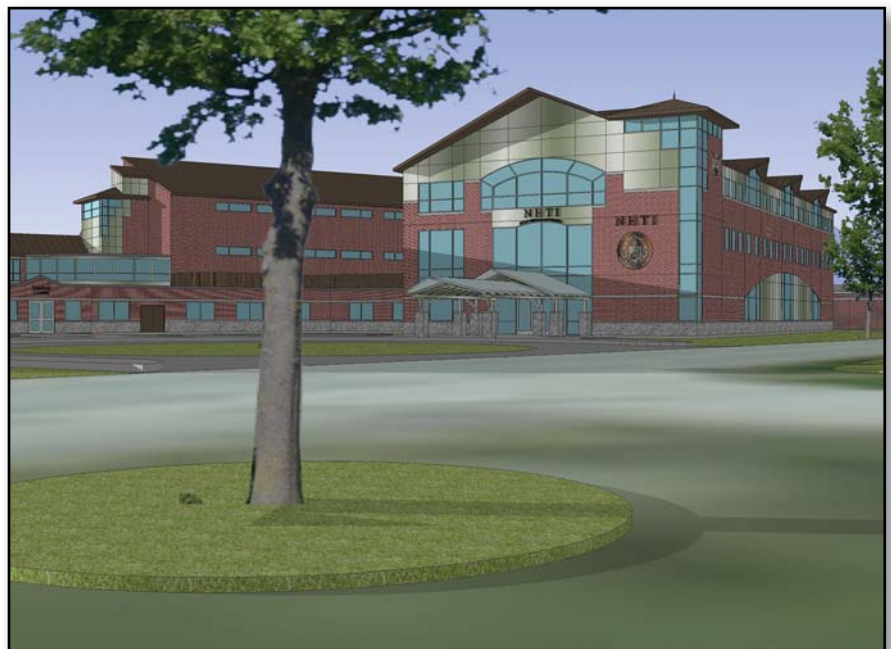
Architect's concept for a new academic building on the NHTI campus.