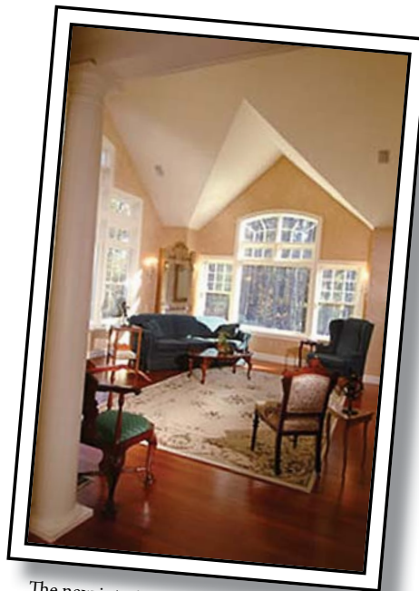
The new interior living room space by DC Designs for a home in Concord, NH.