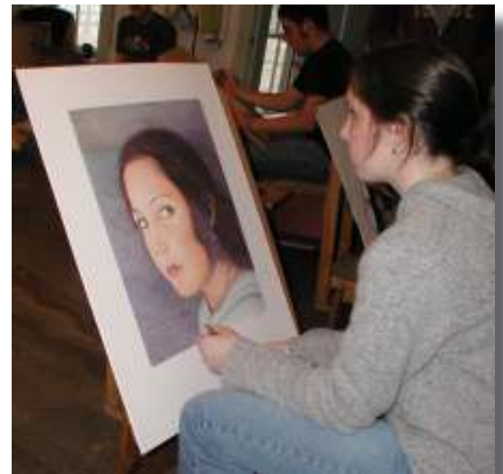
A student in the new Visual Arts program

The IT Applications Development Certificate will enable students to develop a strong background in database development, gain marketable programming skills, and become knowledgeable in web development. The IT Networking Certificate will teach students how to secure networks and servers, and prepare them for the A+ and CCNA Certification exams.