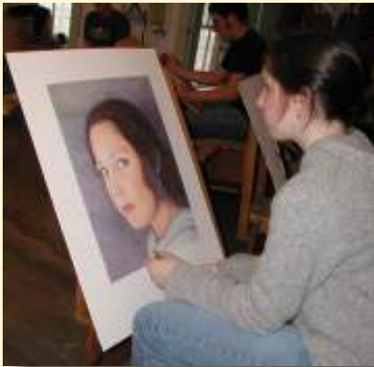
NEW programs at NHTI see page 2