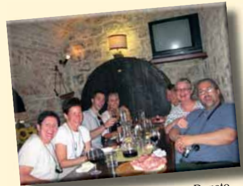
Wine tasting from the tanks of San Donato Frattoria in San Gimignano.

The wayfarers also had an opportunity to learn about—and sample!—various wines served in cafes directly from the tanks of San Donato Frattoria in San Gimignano. In Greve, a visit to Castello Di Vicchiomaggio, a 5th-century castle-turned-vineyard, offered our travelers