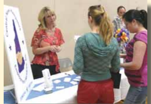
Students visit with a potential employer at the 2nd Annual Career & Job Fair at NHTI, sponsored by the NHTI Alumni Club.