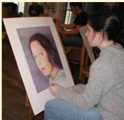
NEW programs at NHTI see page 2

NHTI grads publish fiction and self-help books