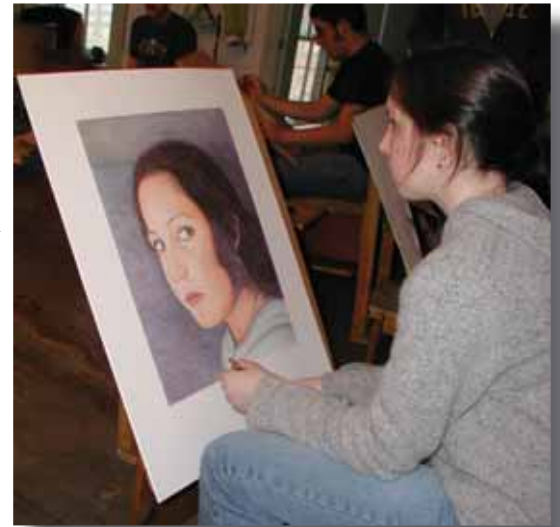
A student in the new Visual Arts program

The IT Applications Development Certificate will enable students to develop a strong background in database development, gain marketable programming skills, and become knowledgeable in web development. The IT Networking Certificate will teach students how to secure networks and servers, and prepare them for the A+ and CCNA Certification exams.